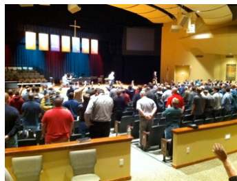
FBBC Mens Conference